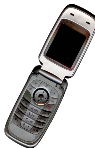
Fig. 3. Example of an image with acceptable resolution

line (e.g. Fig. 2) must be centered whereas multi-line captions must be justified (e.g. Fig. 1). Captions with figure numbers must be placed after their associated figures, as shown in Fig. 1.