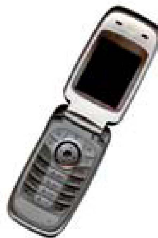
Fig. 2. Example of an unacceptable low-resolution image

Figures must be numbered using Arabic numerals. Figure captions must be in 8 pt Regular font. Captions of a single